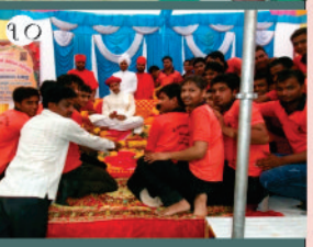
(1) H.H. Shri Mota Maharaj performing Annakut Aarti in Prantij temple on the occasion of Patotsav. (2) H.H. Shri Acharya Maharaj and H.H. Shri Mota Maharaj alongwith Mahant Swami of Bhuj temple, Swami Bhaktivalbhdasji and Parshad Jadavji Bhagat on the occasion of Khat Mhurt of Vishranti Bhuvan at village Bhat. (3) H.H. Shri Mota Maharaj blessings the devotees in the Sabha at Viratnagar. (4) Thousands of people affected by the Natural Calamity of Uttarakhand were provided with the shelter and basic necessities in our Badrinarayan temple. Mahant Swami Golokviharidasji had also arranged for the meals for the affected people. (5) Haribhaktas relishing One Year Akhand Dhoon in Halvad (Muli Desh). (6) Sadguru Mahant Shastri Swami Harikrishnadasji, Sadguru Mahant Swami Devprakashdasji and other saints in the First Sabha organized at Naranghat on the occasion of 41 st janmotsav of H.H. Shri Acharya 1008 Shri Koshalendrprasadj Maharaj. (7) Satsang Sabha in New Vadaj and Karmshakti (Bapunagar) temples. (8) Grou Parayen of Vachanamrit and 141 hour Akhand Dhoon in Mahadevnagar Dhoon. (9) Free of cost distribution of 41000 plants in village Balva. (10) Young devotees of Shree Narnarayandev Yuvak Mandal alongwith H.H. Shri Acharya Maharaj on the occasion of Katha in Manekpur.