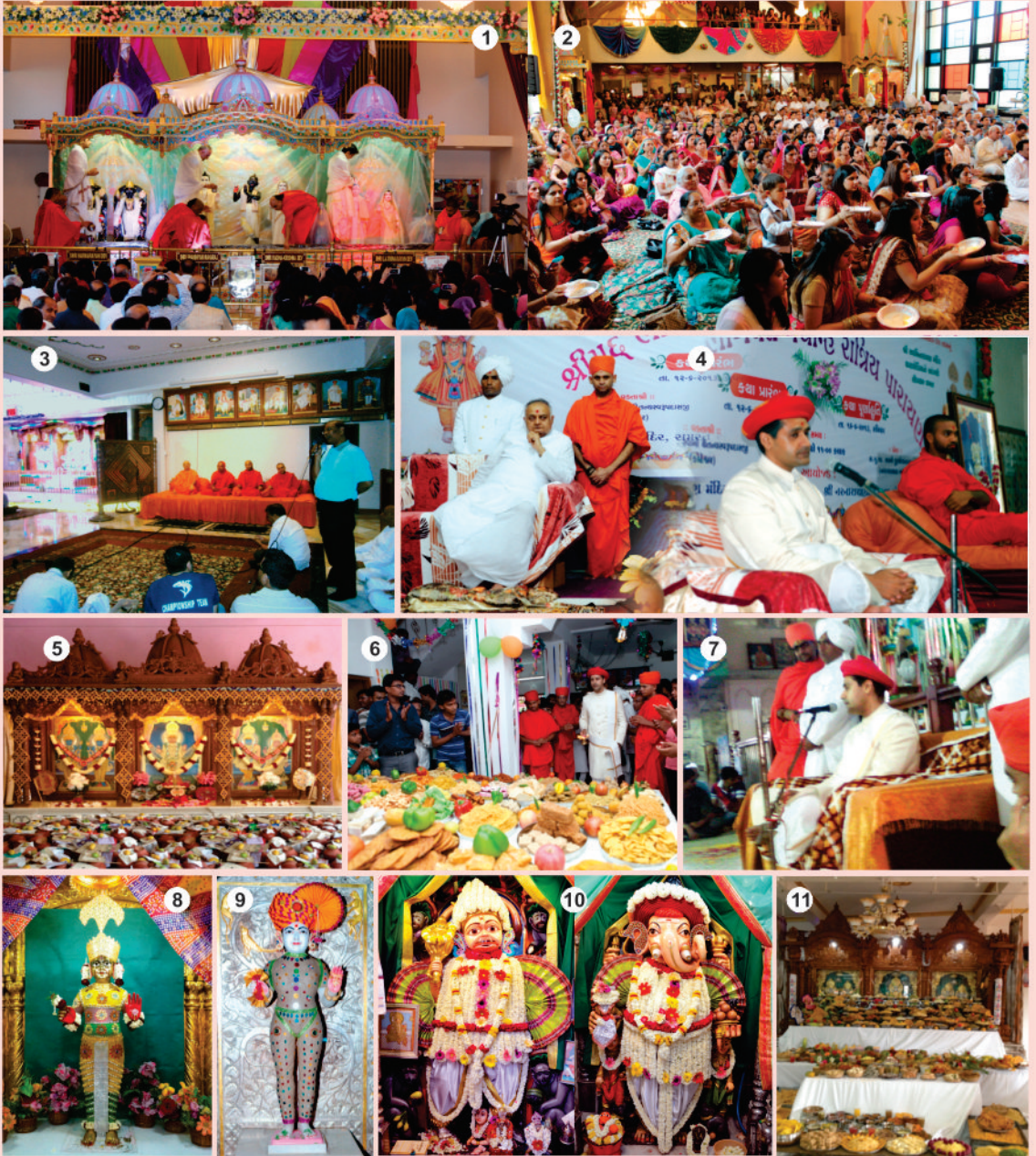
(1-2) All the Three Forms of Shree Hari performing Abhishek of the idol images in the presence of thousands of Haribhaktas on the occasion of Patotsav of our Shree Swaminarayan temple, Cleveland. (3) Satsang Sabha in Chicago temple. (4) H.H. Shri Mota Maharaj granting Darshan and H.H. Shri Acharya Maharaj blessing the devotees in Sabha on the occasion of Parayan in our Ghatlodiya temple (Ahmedabad). (5) Annakut Darshan in Gandhinagar temple. (6) H.H. Shri Acharya Maharaj performing Annakut Aarti on the occasion of invocation of the idol images in New Ranip temple. (7) H.H. Shri Acharya Maharaj blessing the Sabha at Mahadevnagar. (8) Flower Vagha Darshan in Naranghat temple. (9) Chandan Vagha in Mansa temple. (10) Flower Vagha Darshan to Shree Hanumanji and Shree Ganpatiji in Ahmedabad temple. (11) Annakut Darshan in Aadraj temple.