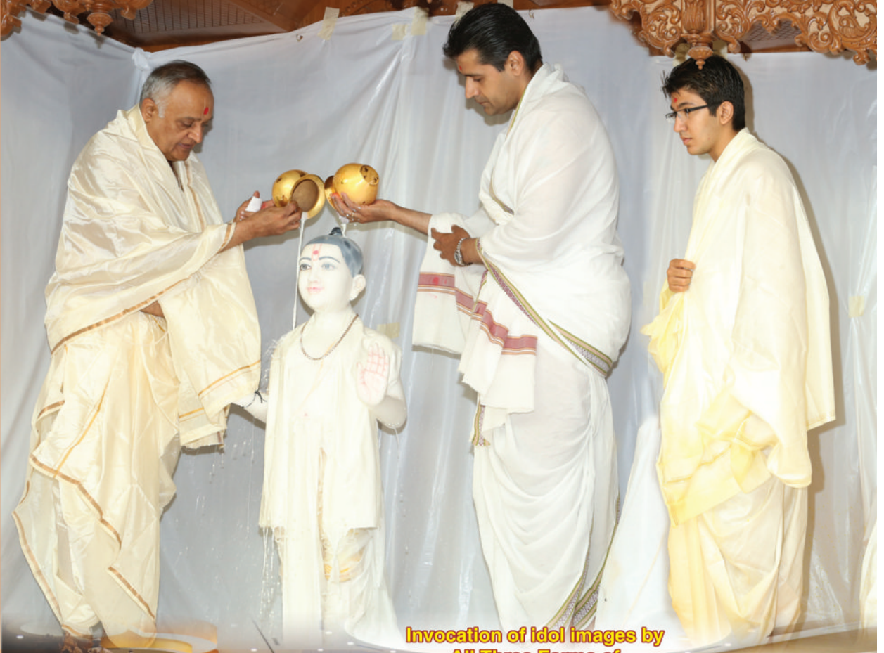
Invocation of Idol images by All Three Forms of Shree Hari in our Shree Swaminarayan temple, Byron (America)